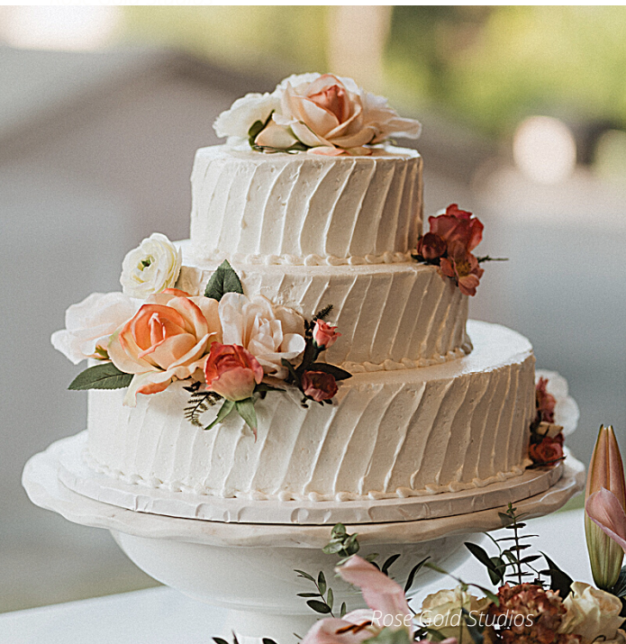
Rose Gold Studios

From base to summit, ceremony to reception, the Bristol Mountain events team would be honored to bring your vision to life.