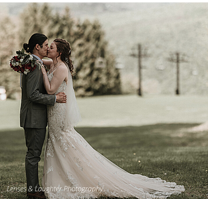
Lenses & Laughter Photography