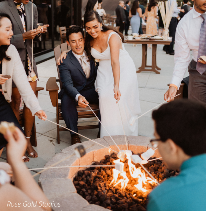
Rose Gold Studios